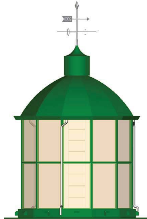
LAM lanternhouse example.

Metallic parts made from AISI 304 or AISI 316 stainless steel, or marine aluminium.